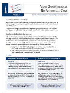
TransACE® SFE State Availability